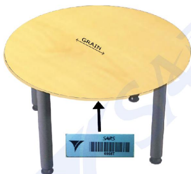
Typical 1200mm diameter 2/4 Seater Meeting Table

NOTE: Chair type for TABLE-01 is CHAIR-01-M-X